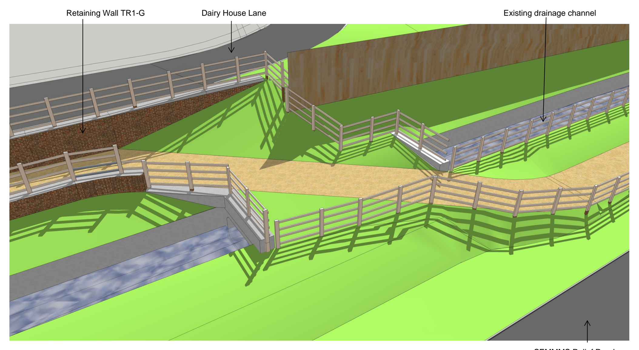
SEMMMS Relief Road